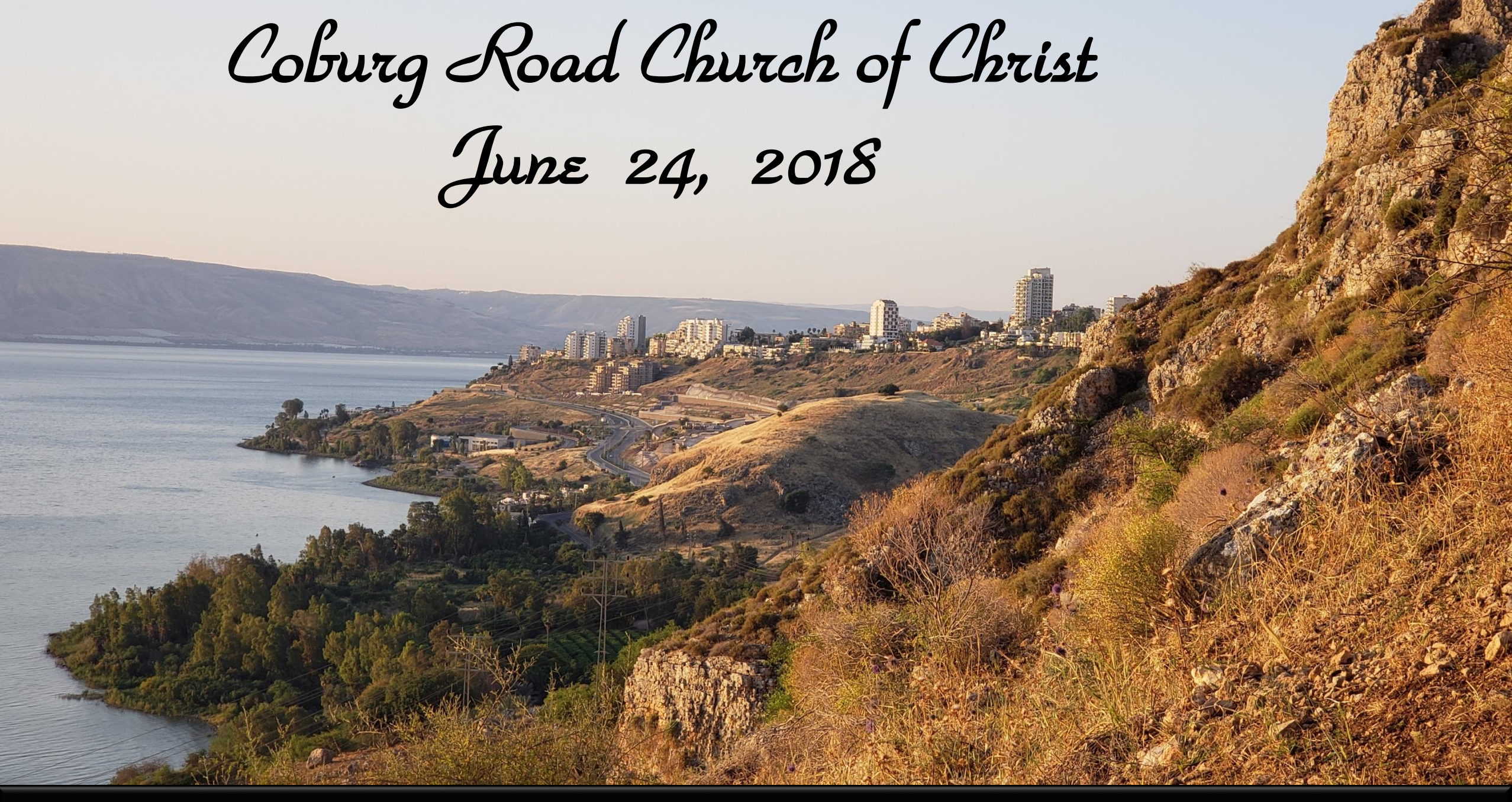
Tiberias On The Western Shore of the Sea of Galilee with Mt. Arbel on the right